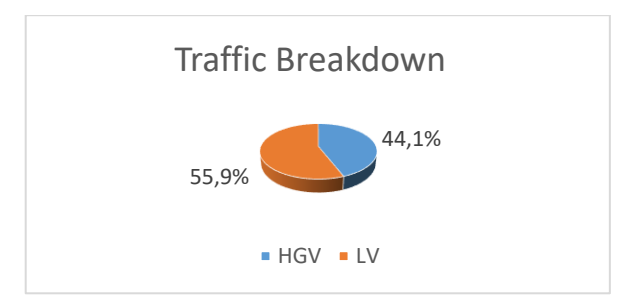
Figure 4: Distribution of Vehicles on ICA Motorway

Vehicle Classes 1-2 is considered according to KGM as; Light Vehicles (LV)