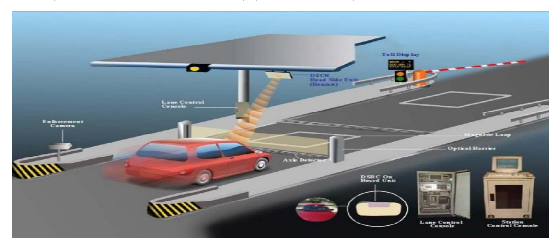
Figure 5: ETC System working principle

ICA's Motorway Network has 59 toll collection equipments in 10 toll plazas.