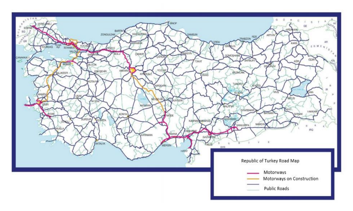
Figure 1: Republic of Turkey Road Map

As of 1.1.17, the length of the Public Roads including both tolled motorways and state roads were 67.161 km whereas that of length have reached to 67.620 km as of 1.1.2018