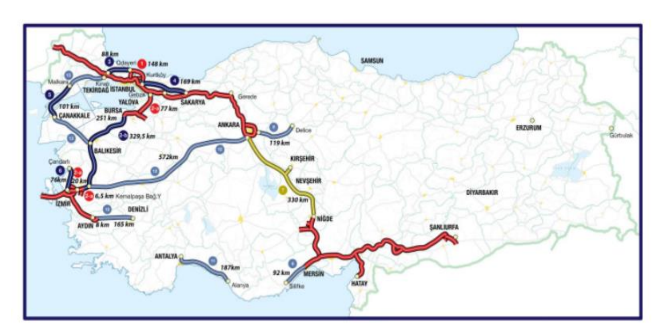
Figure 2: Motorways in Turkey