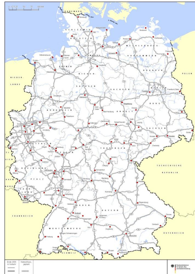
Bestand von Bundesautobahnen - Stand: 1. Januar 2009