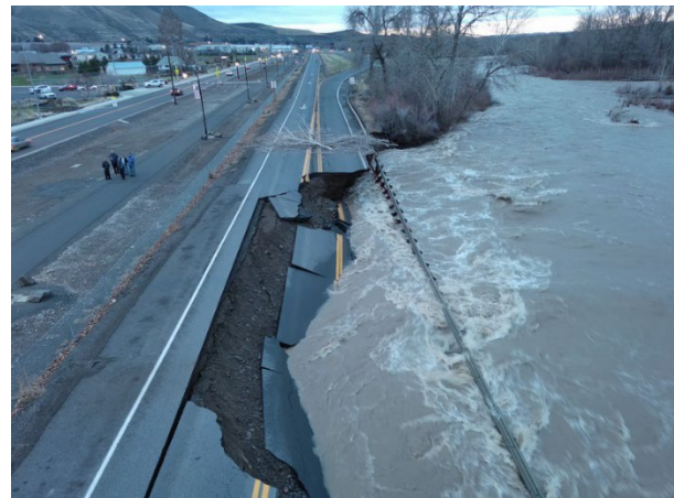
US 12 at Naches