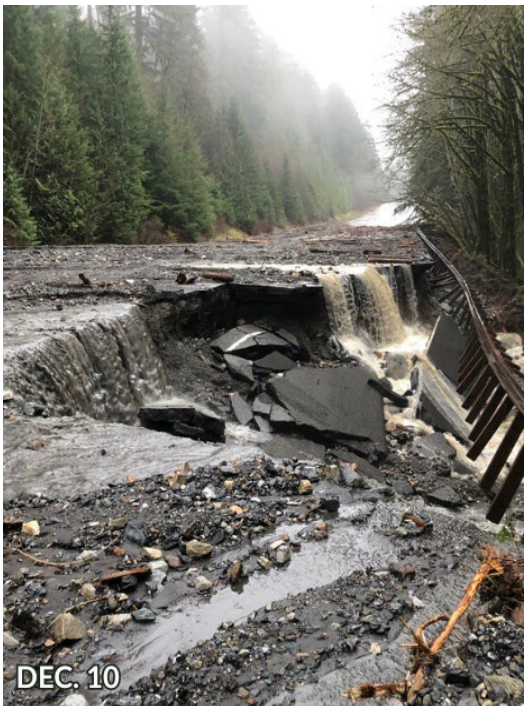
US 2 near Skykomish (milepost 50-64)