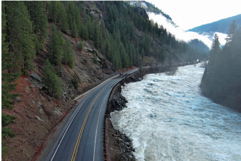
US 2 Road Failure River Flooding