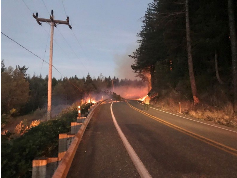
SR 410 Multiday Lane Closure