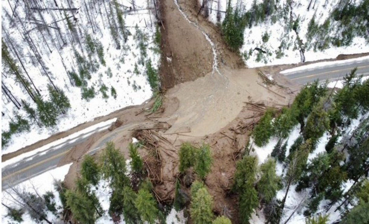
SR 20 Mudslide