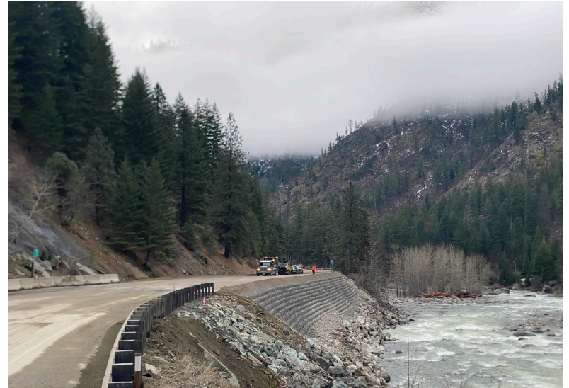
US 2 Repair