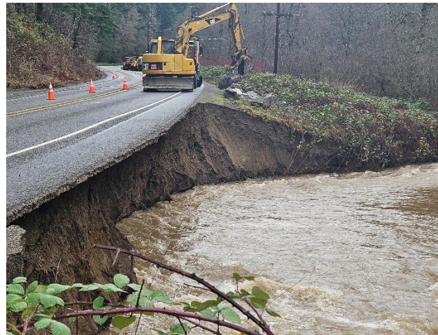
SR 410 near Enumclaw