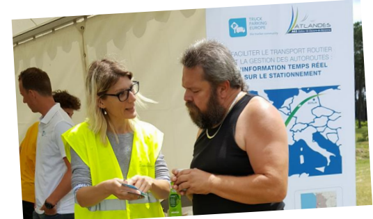
Truck Parking Europe 2018