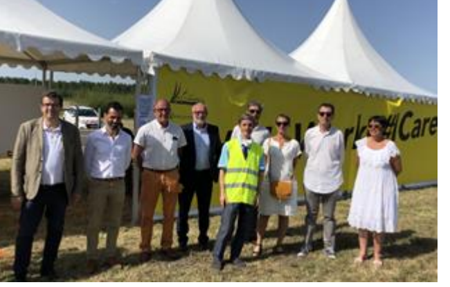
Professional organisations (FNTR-OTRE-TLF-AFTRAL) 2020