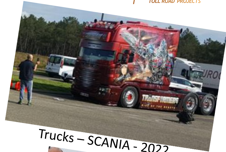
Trucks – SCANIA - 2022