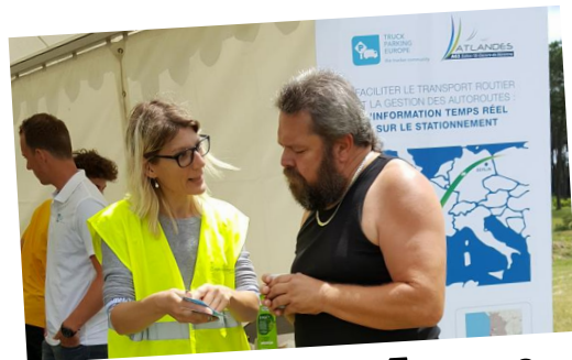
Truck Parking Europe 2018