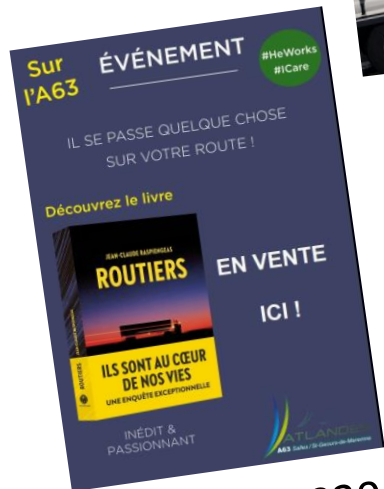
Culture - 2020 23.03.2023