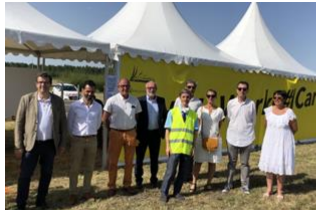
Professional organisations (FNTR-OTRE-TLF-AFTRAL) 2020