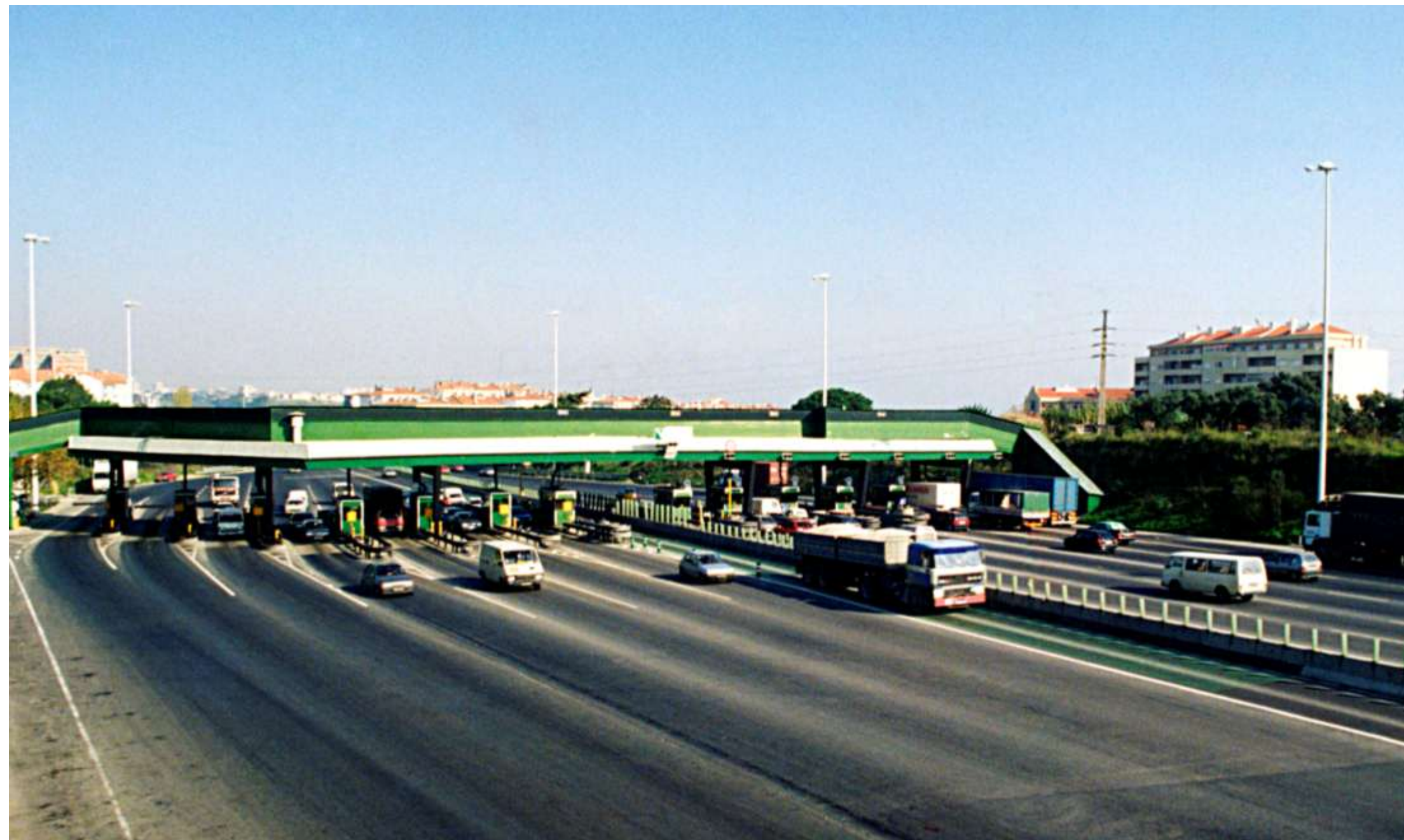
Introduced in 1991

Via Verde - The universal toll collection system in Portugal