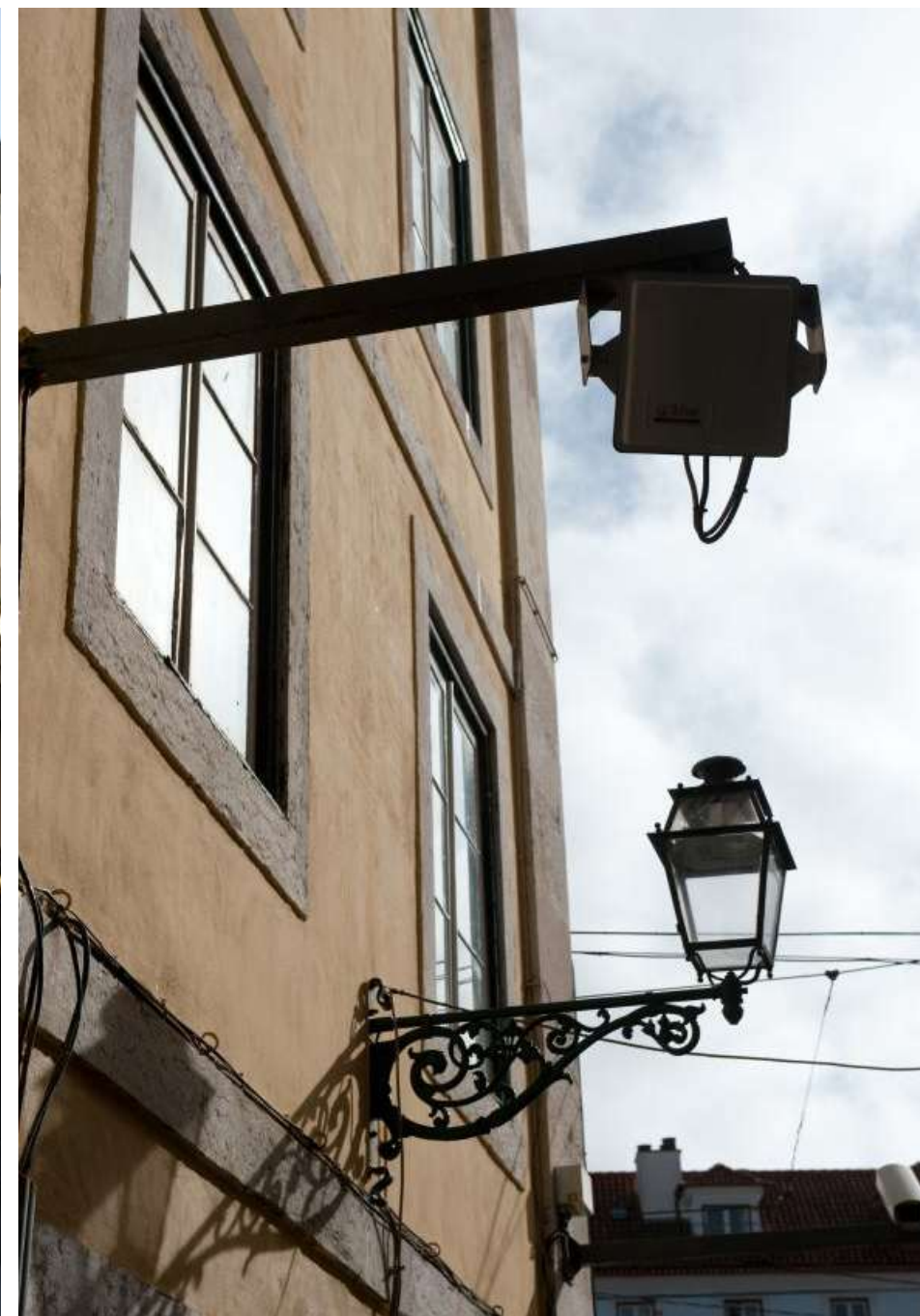
Access to historic center 2005