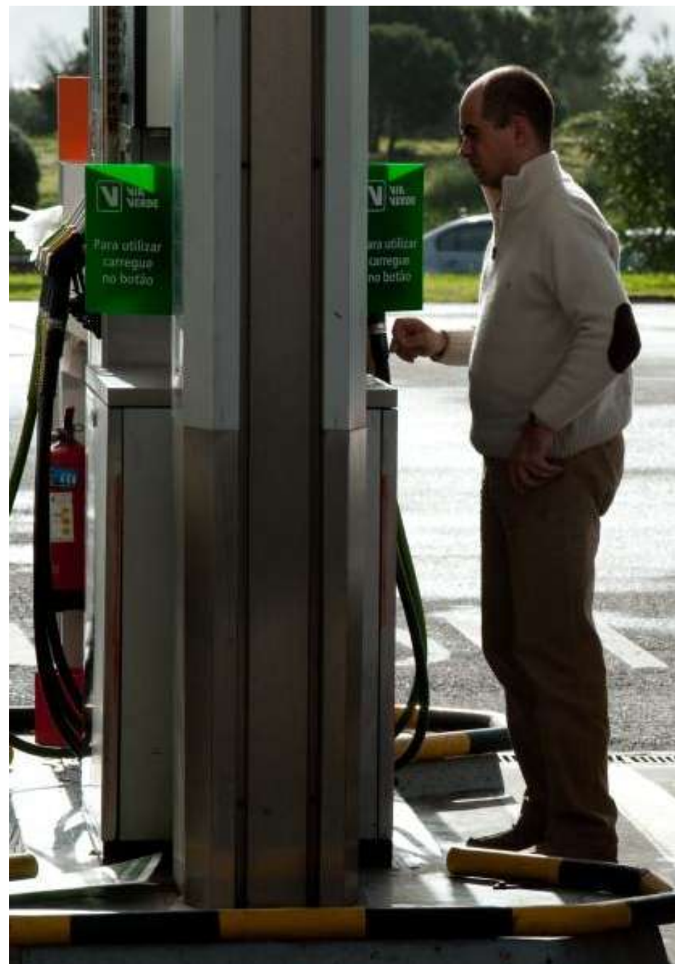
Gas Station 2002