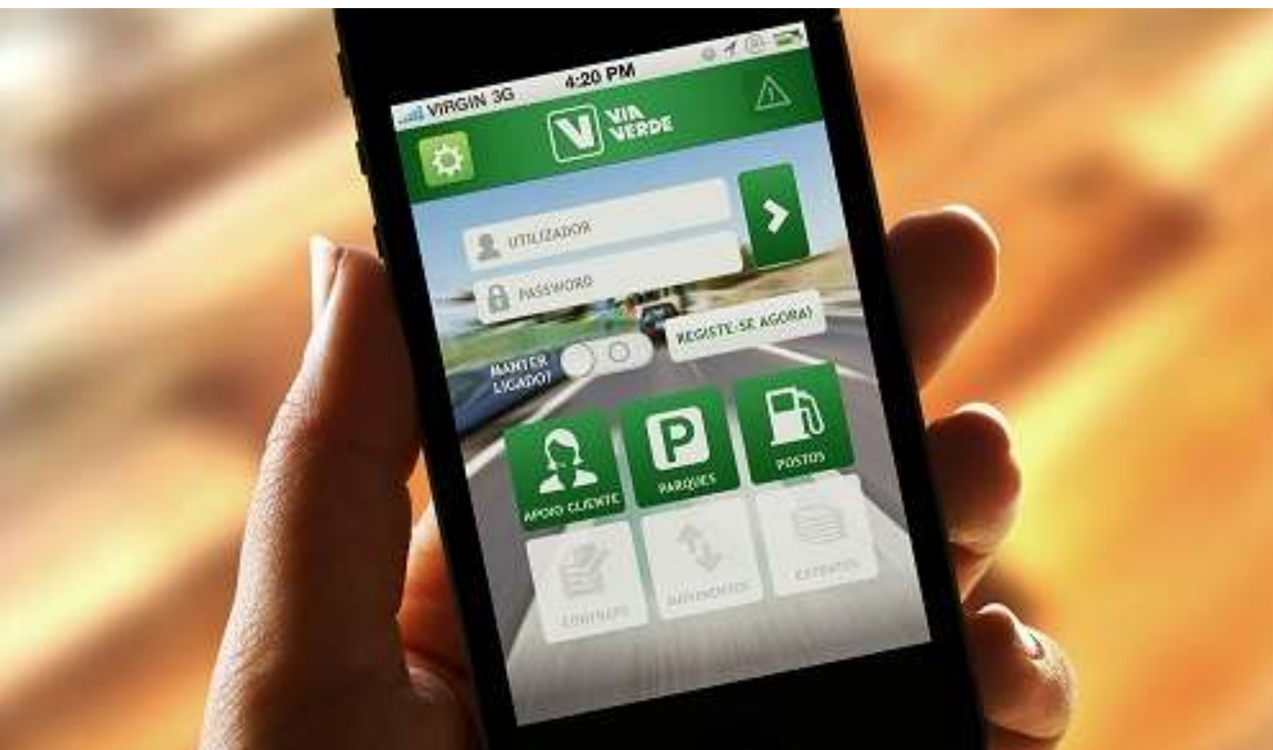
2013 – Transactional app

From historical transactions to mobility payment & beyond